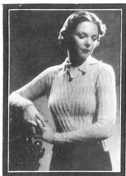
Jumper in Paton's Super, or Beehive, Scotch Fingering, 3-ply (9 ozs.). Bust, 33-35 ins. Length, 19½ ins. SL.133, price 2d.