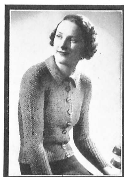
Cardigan in Kelpie Wool (10 ozs.). Bust, 35-37 ins. Length, 19½ ins. SL.139, price 2d.