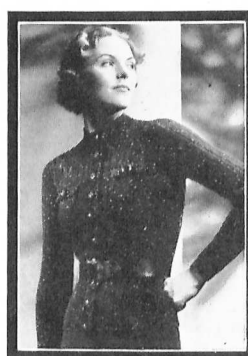
Cardigan-Jumper in Catkin Yarn (11 ozs.). Bust, 32 ins. Length, 21½ ins. SL.136, price 2d.