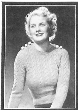
Jumper in Paton's Super Scotch Fingering, 4-ply (8 ozs.). Bust, 34 ins. Length 20 ins. SL.137, price 2d.