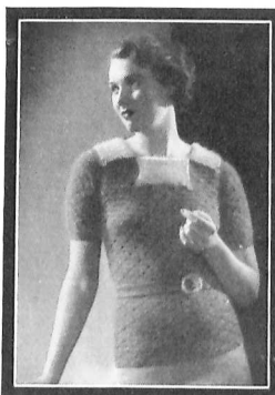
Jumper in Paton's Super, or Beehive, Scotch Fingering, 2-ply (4 ozs.), and 6 hanks Beryl Fine-Spun Angora. Bust, 32 ins. Length, 20½ ins. SL.135, price 2d.