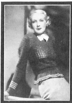
Jumper in Veronica Showerproof Wool, 3-ply (11 ozs.). Bust, 32 ins. Length, 20 ins. SL.134, price 2d.