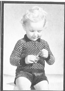
SL. 215, price 2d.