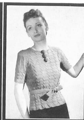
SL.219, price 2d.