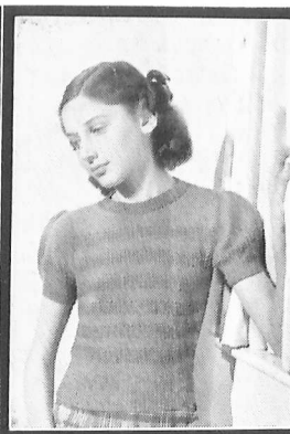
SL.217, price 2d.