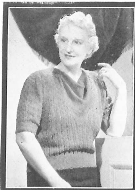
SL. 212, price 2d.