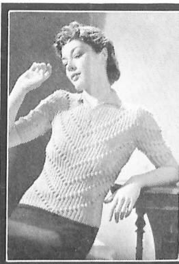
SL. 213, price 2d.