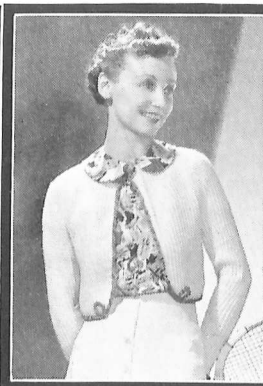
SL. 214, price 2d.